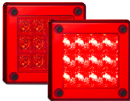
Stop/Tail 280RM - Single Blister