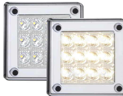
Reverse 280WM - Single Blister